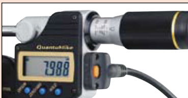
Measurement data output function is available with a water-resistant connection cable.