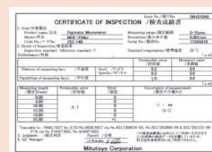
Certificate of inspection