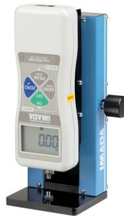
[MSF-50N (Force gauge is not included)]

Good portability. Force measurement can be done, carrying around.