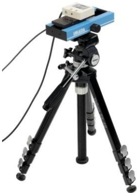
[MS-02: Screw adaptor] Makes force-displacement measurement compact and convenient.