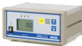
Digital Force Analyzer “FA-PLUS”

http://www.forcegauge.net/catalog/products/specification/fsm.pdf