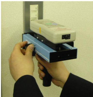
[MS-01:Handle] Makes stand easy to handle