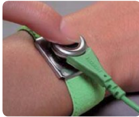
Press the hook to detach the ground cord.