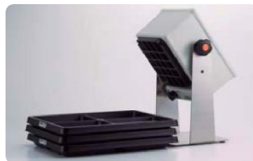
Example of neutralization of electronic parts on a tray.