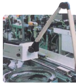
Example of neutralization of electronic parts in a parts feeder.