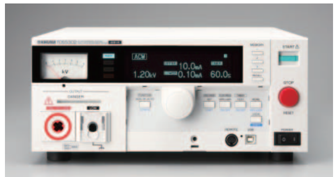
▲ View with the protection cover removed

In consideration of safety for the operator and the environment, the output terminal of HIGH-side has been placed in the most distant location from the control area. The free rotation mechanism protects from twisting (or breaking) of the cable. Also, with having the lock function for the LOW terminal on the main unit, the metal plate is no longer attached to the test lead of LOW-side, and it makes to resist damage to the test lead. Because of elimination of these projected components, the TOS5300 can avoid from unexpected accidents such as when the unit travels to other location. And also when the test lead is snagged on something, or unexpected stress is applied on the test lead, the High (High-voltage) test lead is designed to disconnect easily, but the Low (ground) test lead is designed to resist disconnection. In order to prevent the insertion error, the color coding of the cable are classified to HIGH (red) and LOW (black), and the plug shape of terminal are also different design.